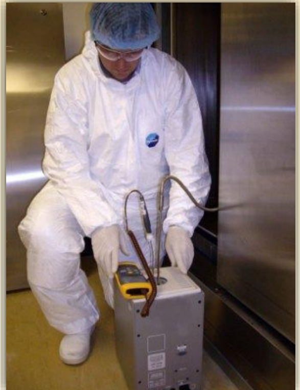
A Honeyman Engineer calibrating a client temperature probe

We understand the sensitive nature of your process or product. Therefore, to discuss your requirements with one of our experts in a confidential manner, please contact us with your details and a brief introduction, so we can arrange a call back at a time convenient to you. The Honeyman Group offers a variety of validation activities encompassing equipment qualification (laboratory, packaging and manufacturing), process validation (API, product and utilities), cleaning validation, shipping/transportation studies and re-validation/re-qualification exercises.