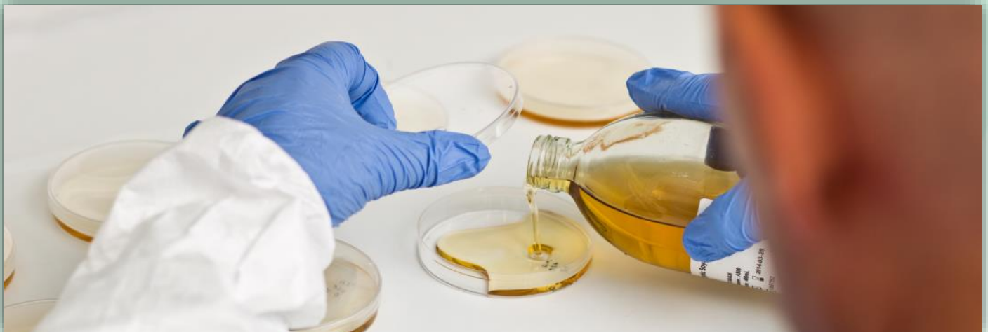
David, Microbiology Consultant, performing total viable count by pour plate