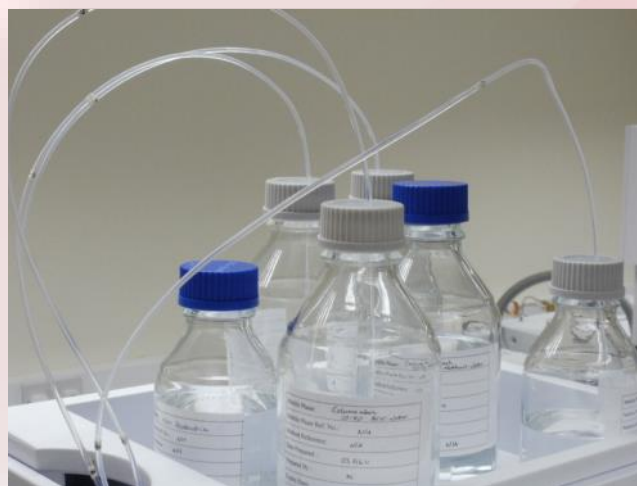
HPLC solvents on an Agilent 1200 series instrument

Further tests and techniques available - Contact us, we might be able to help!