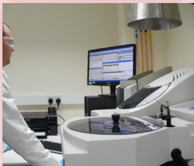
Thermo Fisher Flame & Furnace AAS