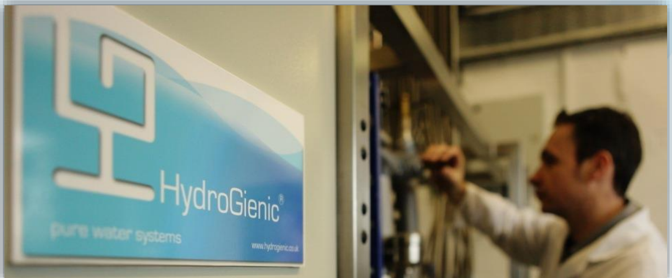
A HydroGienic® purified water system installed at Dechra Manufacturing in the UK

HYDROGIENIC® is Honeyman Groups range of Purified Water & Water For Injection systems. Offering significant benefits over competing systems, HYDROGIENIC® will provide a compliant, cost effective solution to your on site quality water needs.